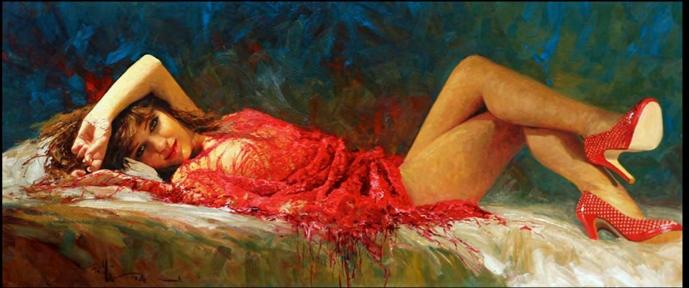
'Red Shoes' 30" x 60" Oil on Canvas