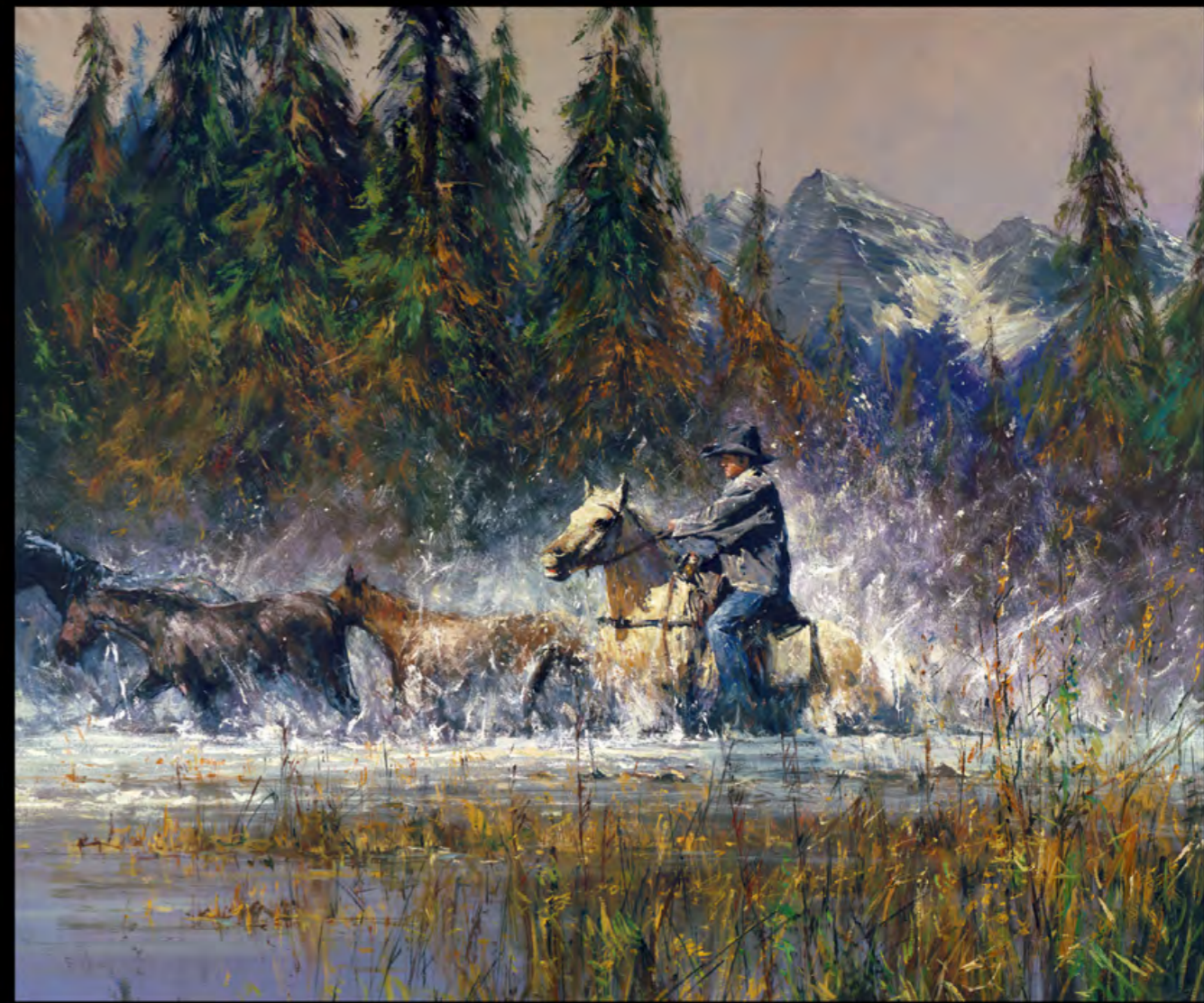
'Tough Ride' 30" x 40" Oil on Canvas