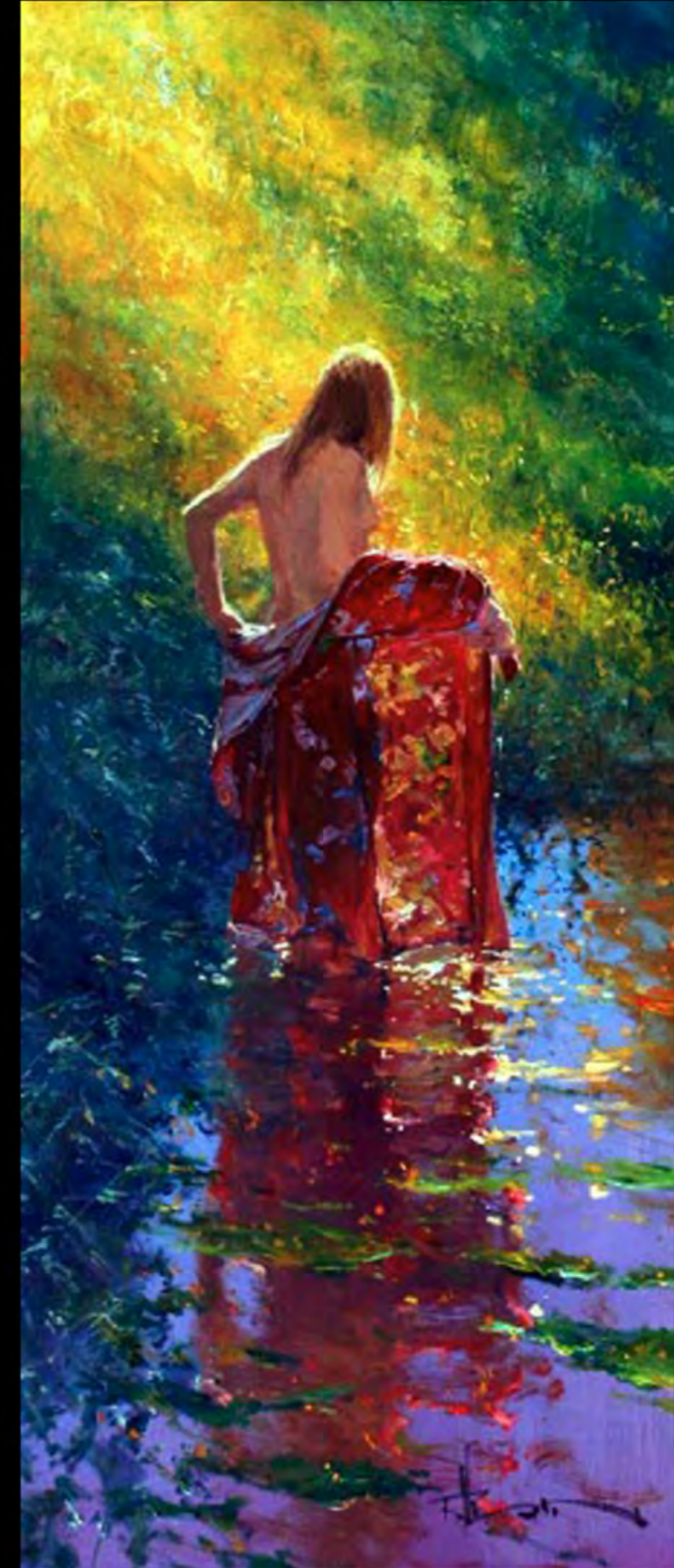
'Cool Break' 20" x 40" Oil on Canvas