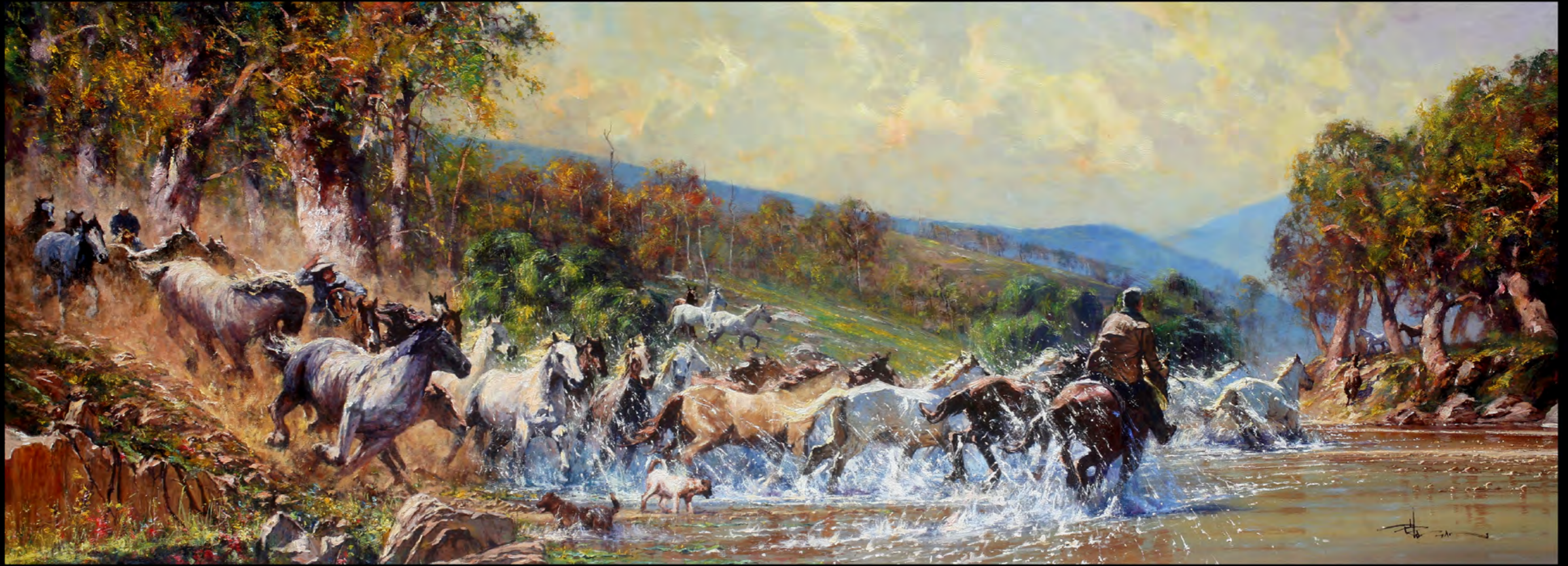
'Outpaced' 96" x 40" Oil on Canvas