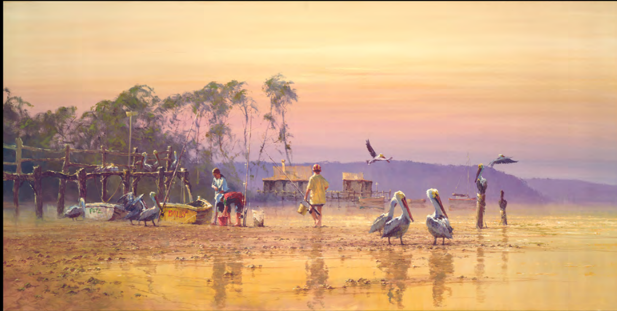
'Pelican Point' 24" x 48" Oil on Canvas