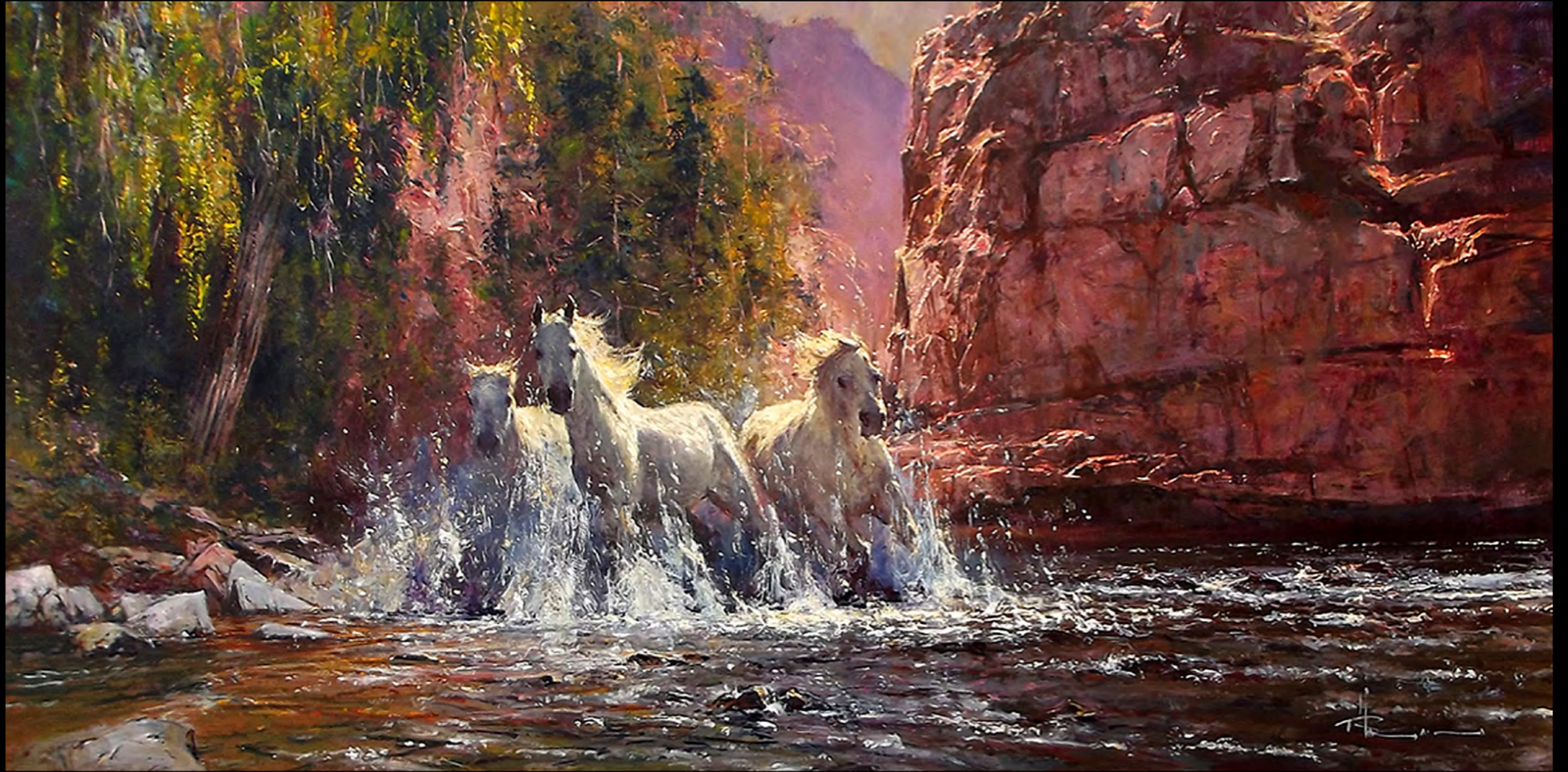
'Follow The Leader' 48" x 24" Oil on Canvas