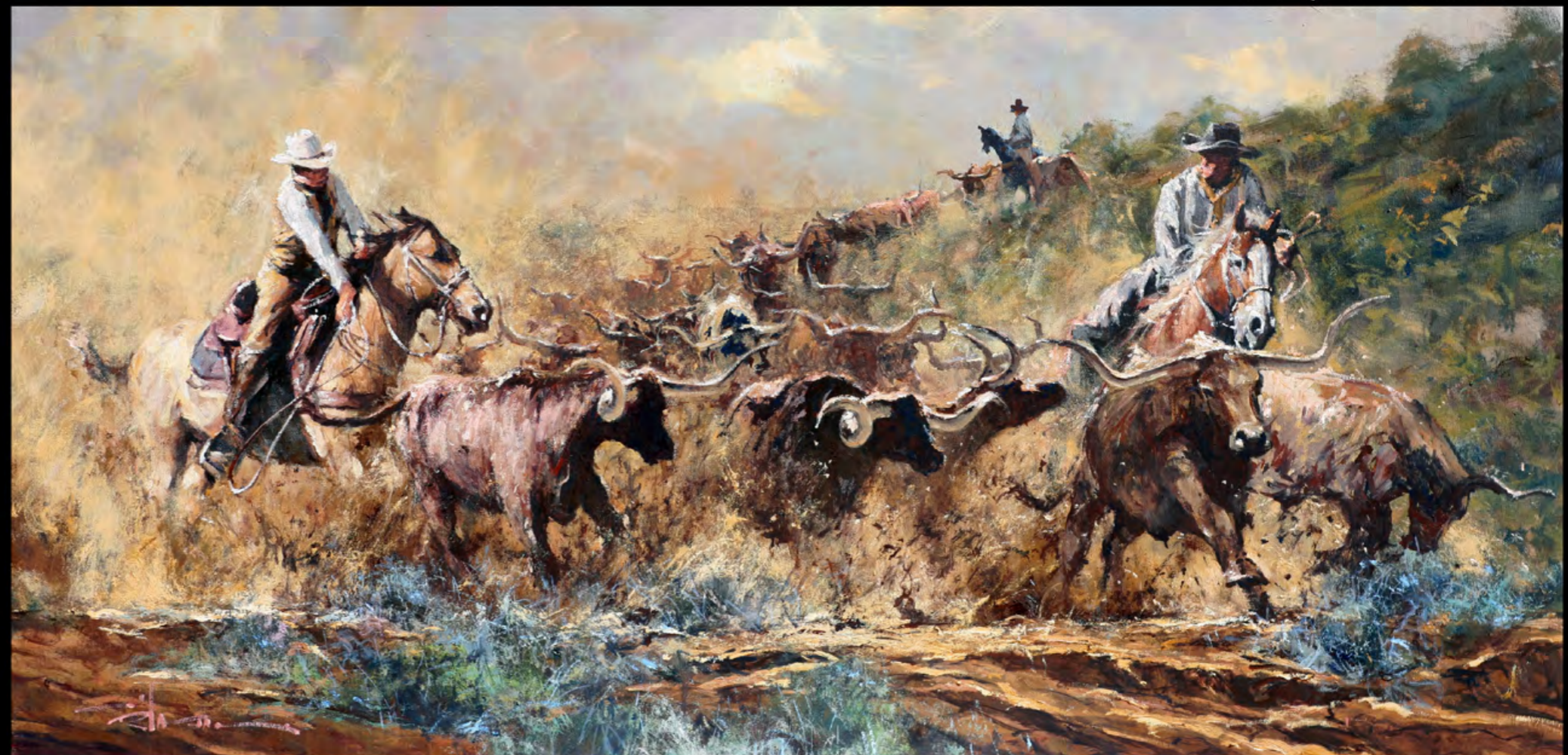
'Runaways' 30" x 44" Oil on Canvas