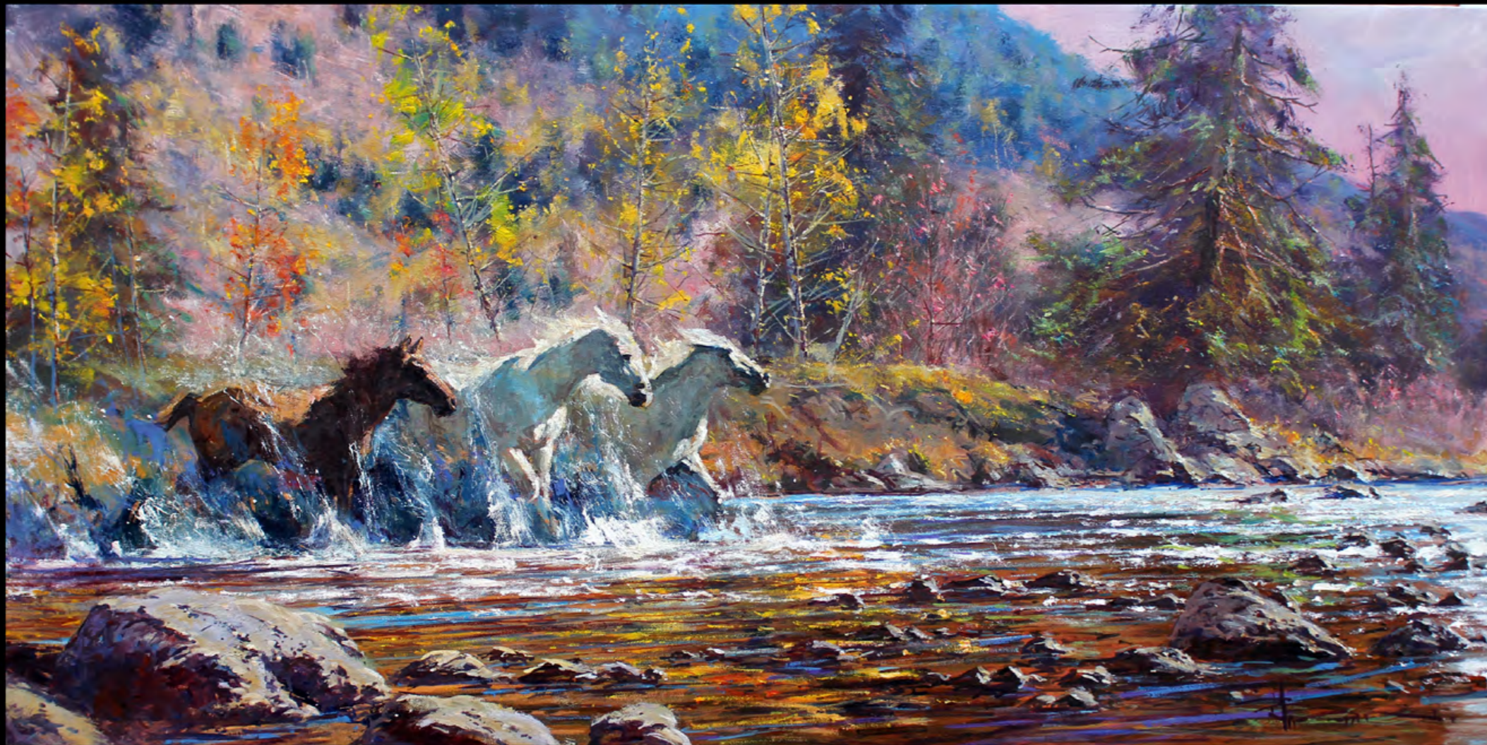
'Run Free' 24" x 48" Oil on Canvas