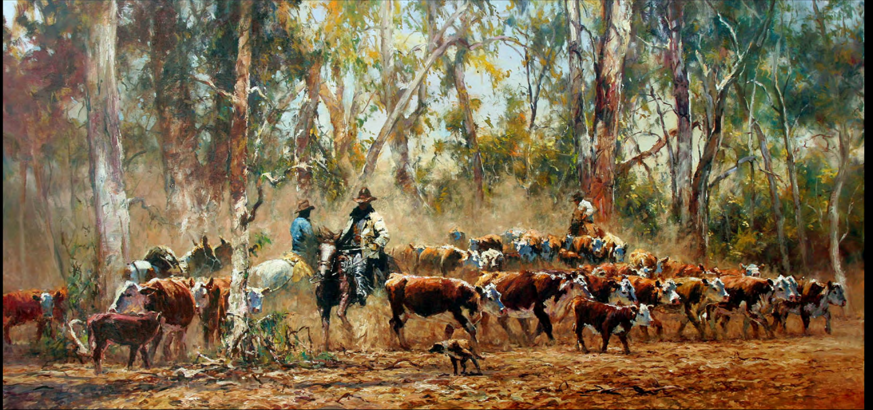
'Through The Scrub' 98" x 24" Oil on Canvas