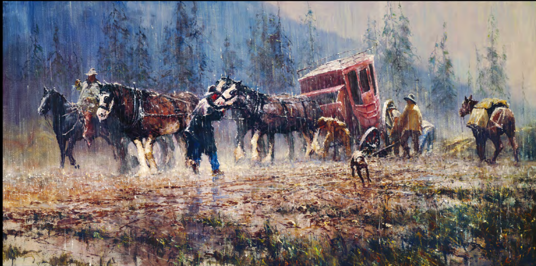
'Unplanned Break' 96" x 30" Oil on Canvas