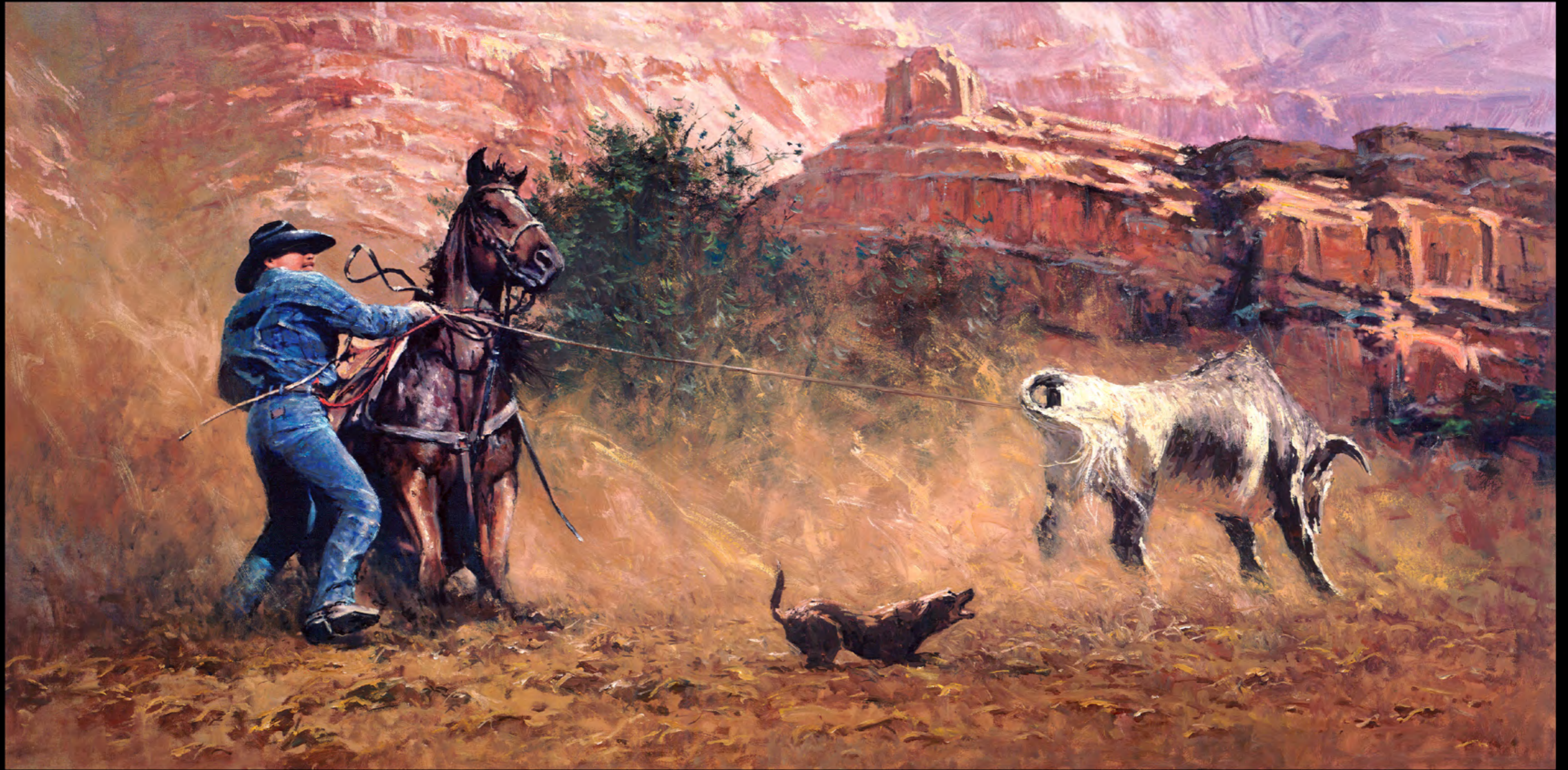
'Teamwork' 30" x 40" Oil on Canvas