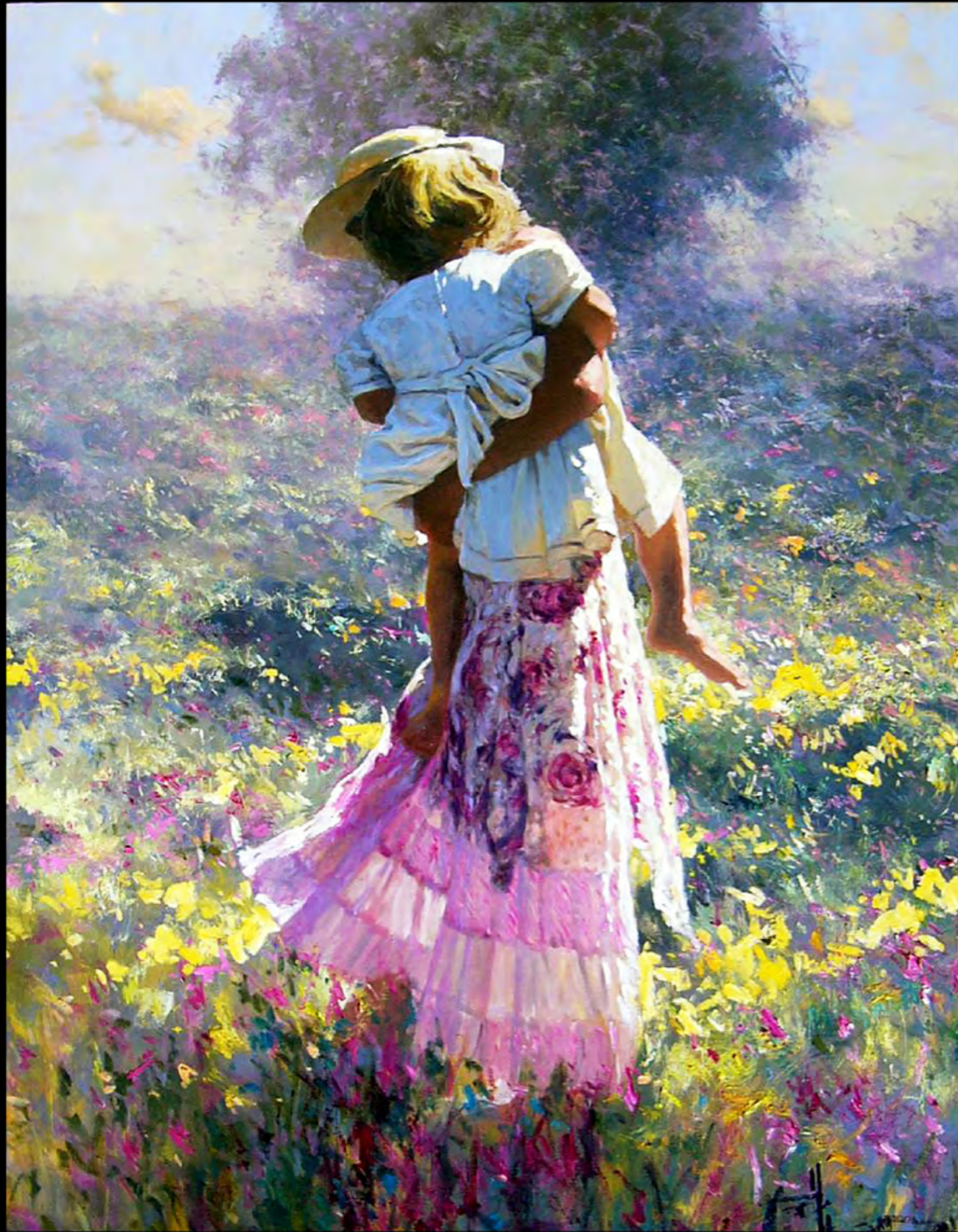
'Safe Hands' 30" x 40" Oil on Canvas