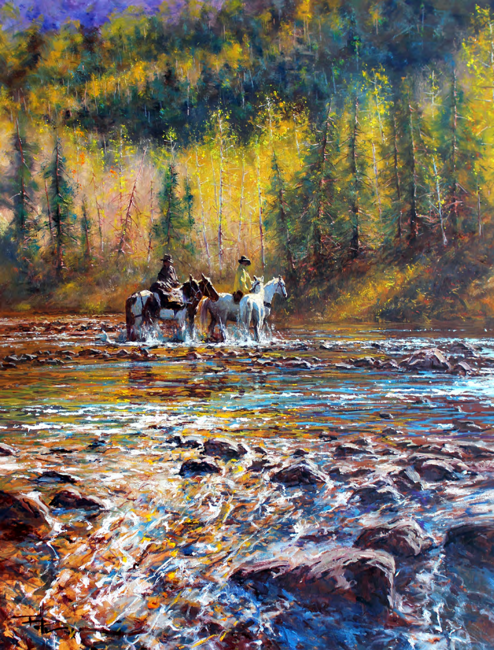
'Mountain Men' 40 x 60" Oil on Canvas