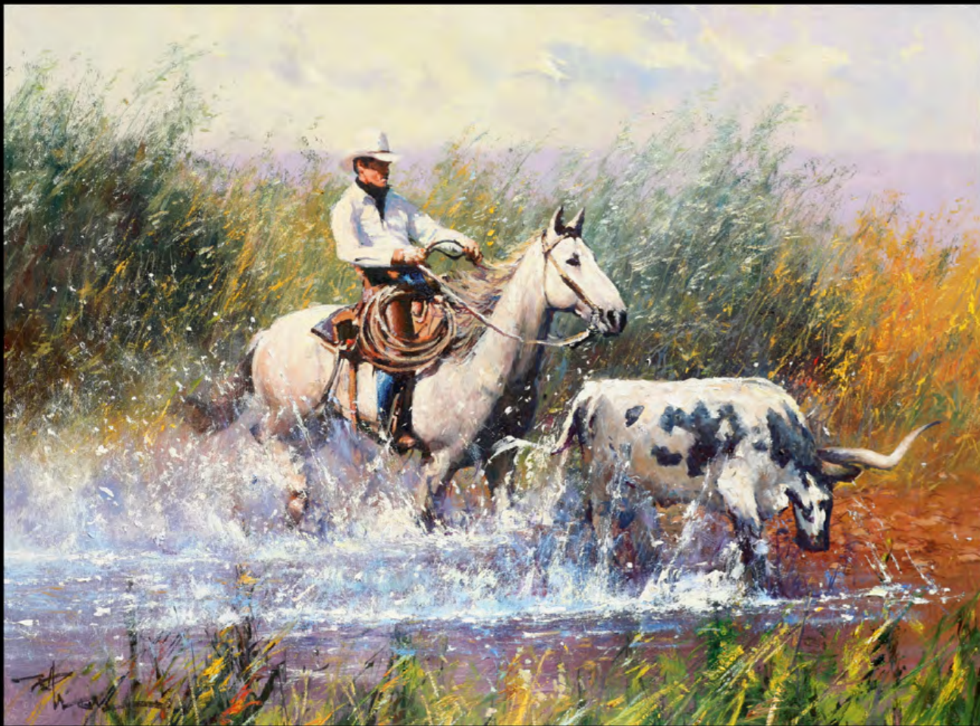
'Renegade' 24" x 30" Oil on Canvas