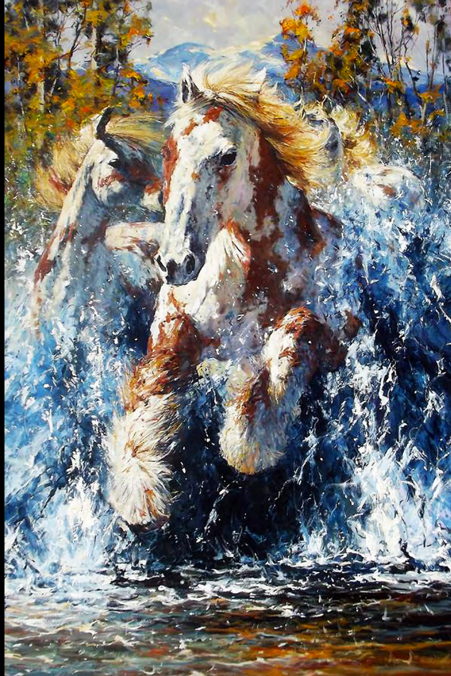
'The Leader' 30" x 40" Oil on Canvas